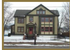
937 West Fourth St.

Lycoming County: 2138 Lincoln Street Williamsport, PA 17701 570-327-5420 step@stepcorp.org