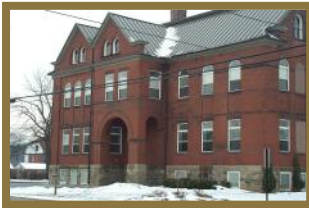
845 Park Ave.

Two convenient locations in Williamsport, PA