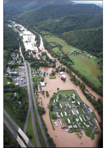
Photo of Trout Run just after Lycoming Creek crests on September 7, 2011.

Essentially, this program will pay the difference between the amount FEMA provides to flood victims for temporary housing and the actual rates in Lycoming County. The program will coincide with FEMA's time frame for temporary housing assistance, which is two months with an option of extension to a maximum of 18 months after displacement. This program, developed in conjunction with FEMA's Disaster Recovery Center, is funded by the Williamsport-Lycoming Community Foundation of Pennsylvania, with assistance from the Board of Commissioners for Lycoming County's ACT 137 Fund.