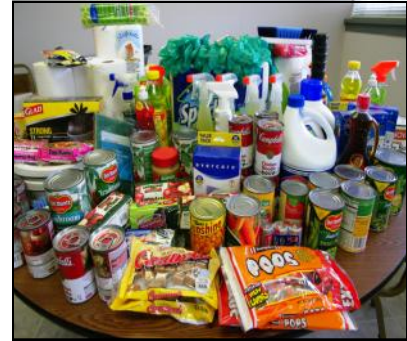
Supplies collected for flood-affected co-workers.

A number of staff assisted several fellow employees who were flood victims, either by collecting supplies and food items, delivering these items and/or equipment to them to aid in their recovery, or directly assisting in some of the cleanup efforts.