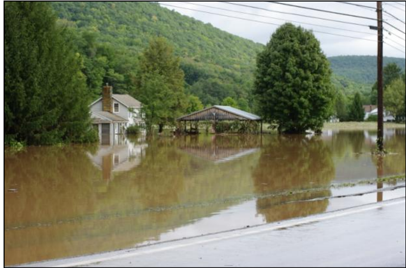
Flood waters from Tropical Storm Lee, north of Montoursville.

As a community, we are acutely aware of the local property devastation that occurred from the September disaster. Although several months have passed, many homeowners still face immense challenges to reoccupy their homes. As a result, STEP is launching two programs to assist flood victims: Homes In Need Flood Recovery and Housing Assistance Gap Funding .