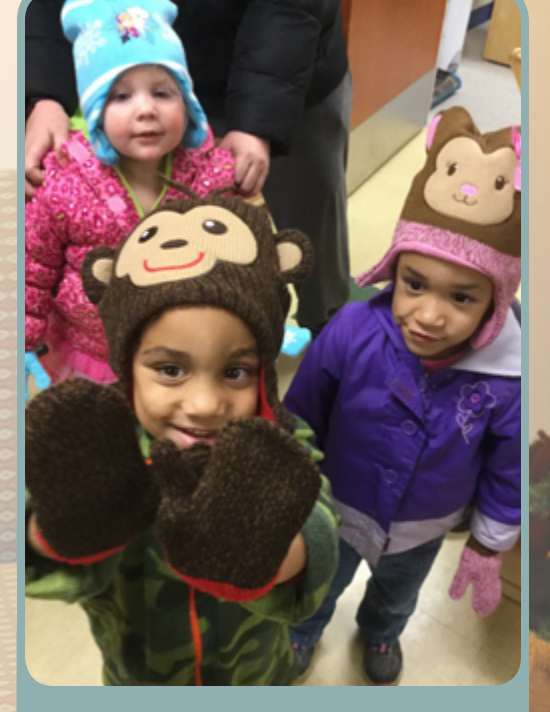
STEP Head Start children are excited to show off the cold-weather essentials they received from the Mitten Tree.