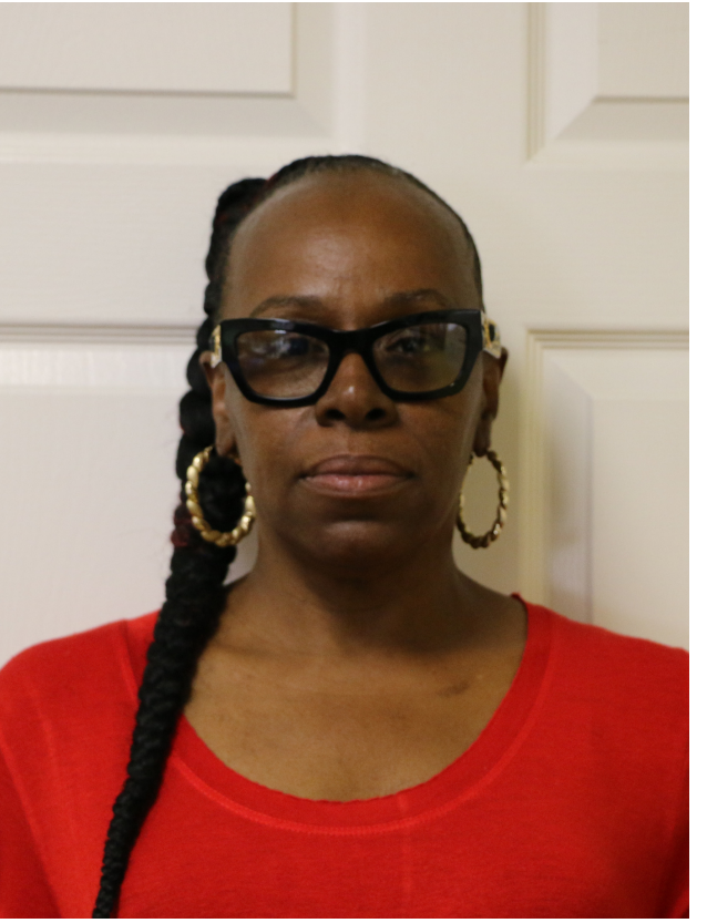
Valerie Burton Cochran Primary School