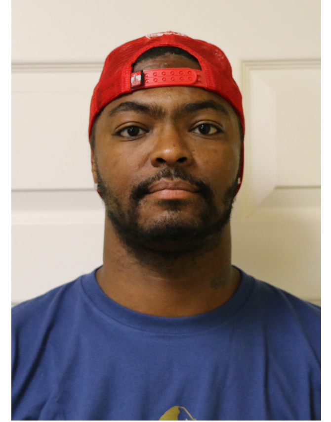
Odren Polk Hepburn Lycoming Primary School