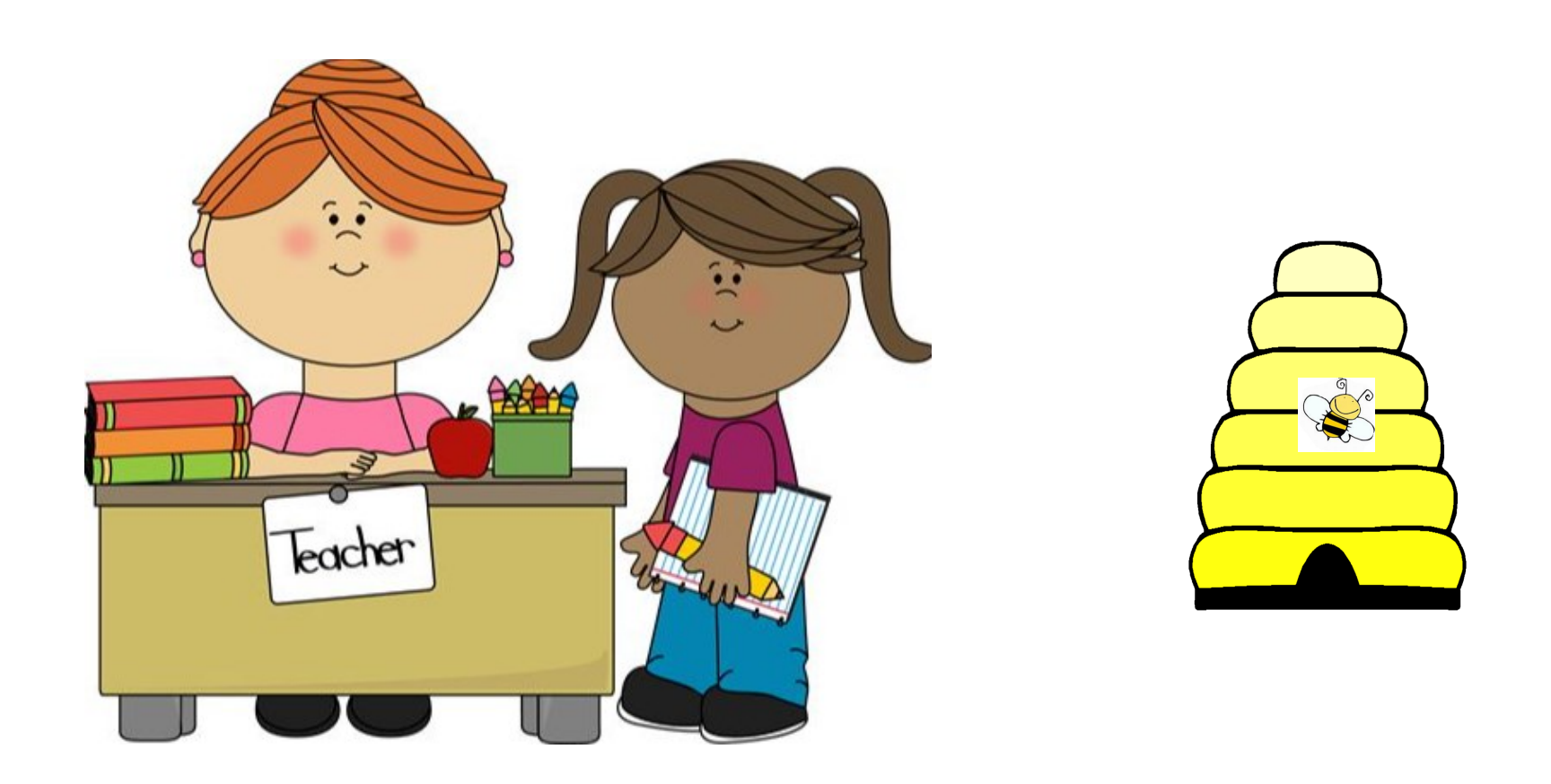
At school, I have a beehive. My teacher gives me bees to put on my beehive when I am being safe, kind, and responsible!